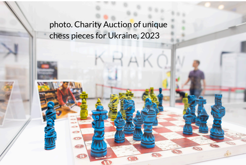
photo. Charity Auction of unique chess pieces for Ukraine, 2023