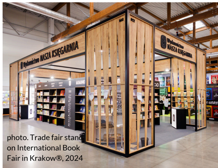
photo. Trade fair stand on International Book Fair in Krakow®, 2024

At the beginning of 2025, we introduced an electronic workflow to reduce paper consumption, reduce CO2 emissions and promote greener practices, supporting our sustainability efforts.