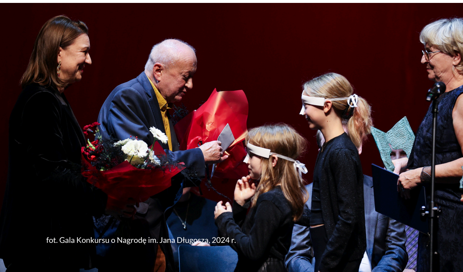
fot. Gala Konkursu o Nagrodę im. Jana Długosza, 2024 r.

Krakow® since 1998, is to promote popular science books in the broad field of humanities, thereby encouraging and motivating publishers present in the Polish market to publish the works of Polish scientists and researchers. The works submitted for the Award provide in-depth knowledge and serve as rich material for reflection, becoming not only reading material but also subjects for study. The publications promoted in the competition also reinforce the image of Krakow and Małopolska as a region that has, for centuries, set the direction for the development of Polish thought, dictated the pace of ongoing changes, and influenced the shaping of the national identity of Poles. The correctness of the works during the preparation for the competition is overseen by the Jury, which consists of distinguished representatives of the Polish scientific community.