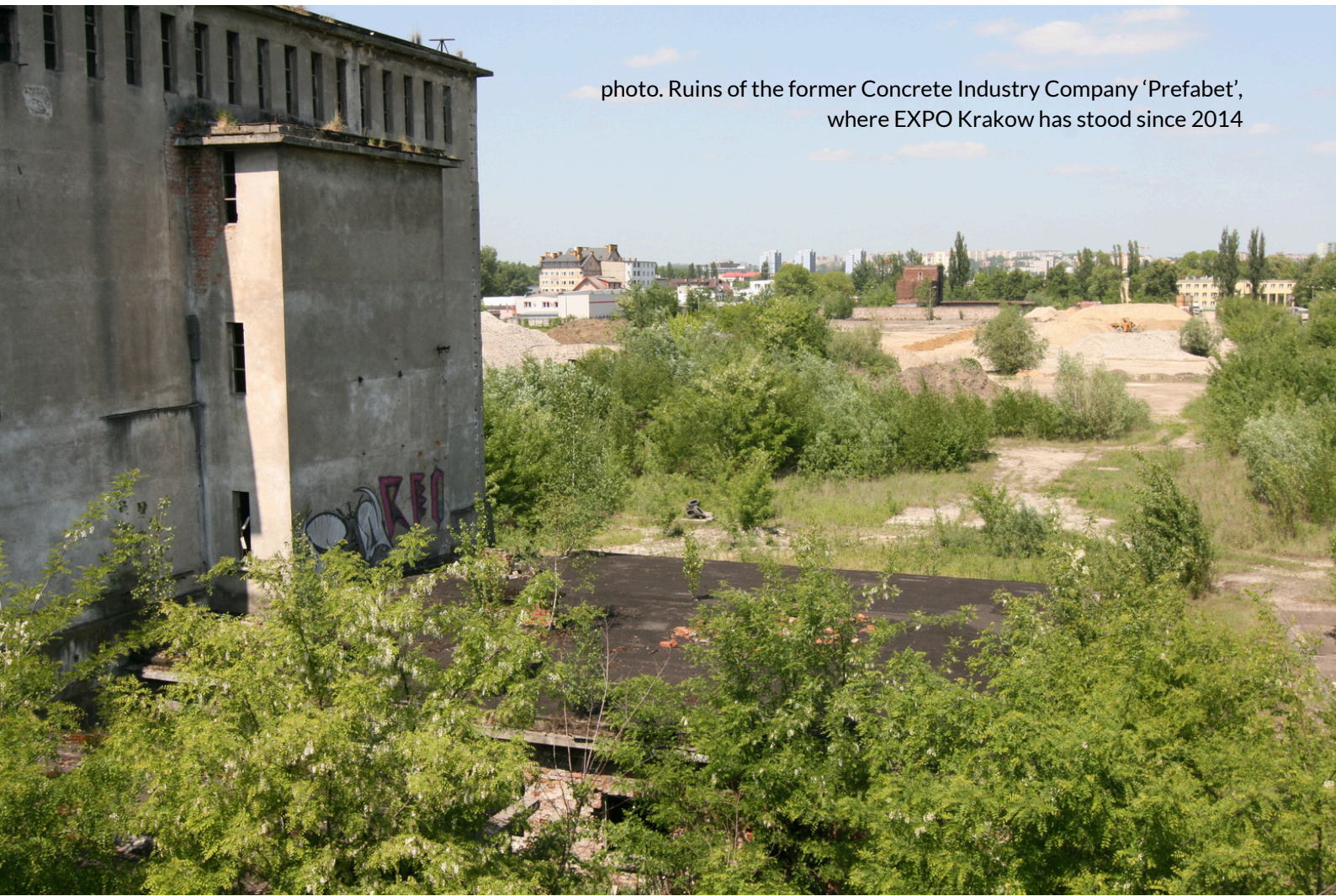
photo. Ruins of the former Concrete Industry Company 'Prefabet', where EXPO Krakow has stood since 2014