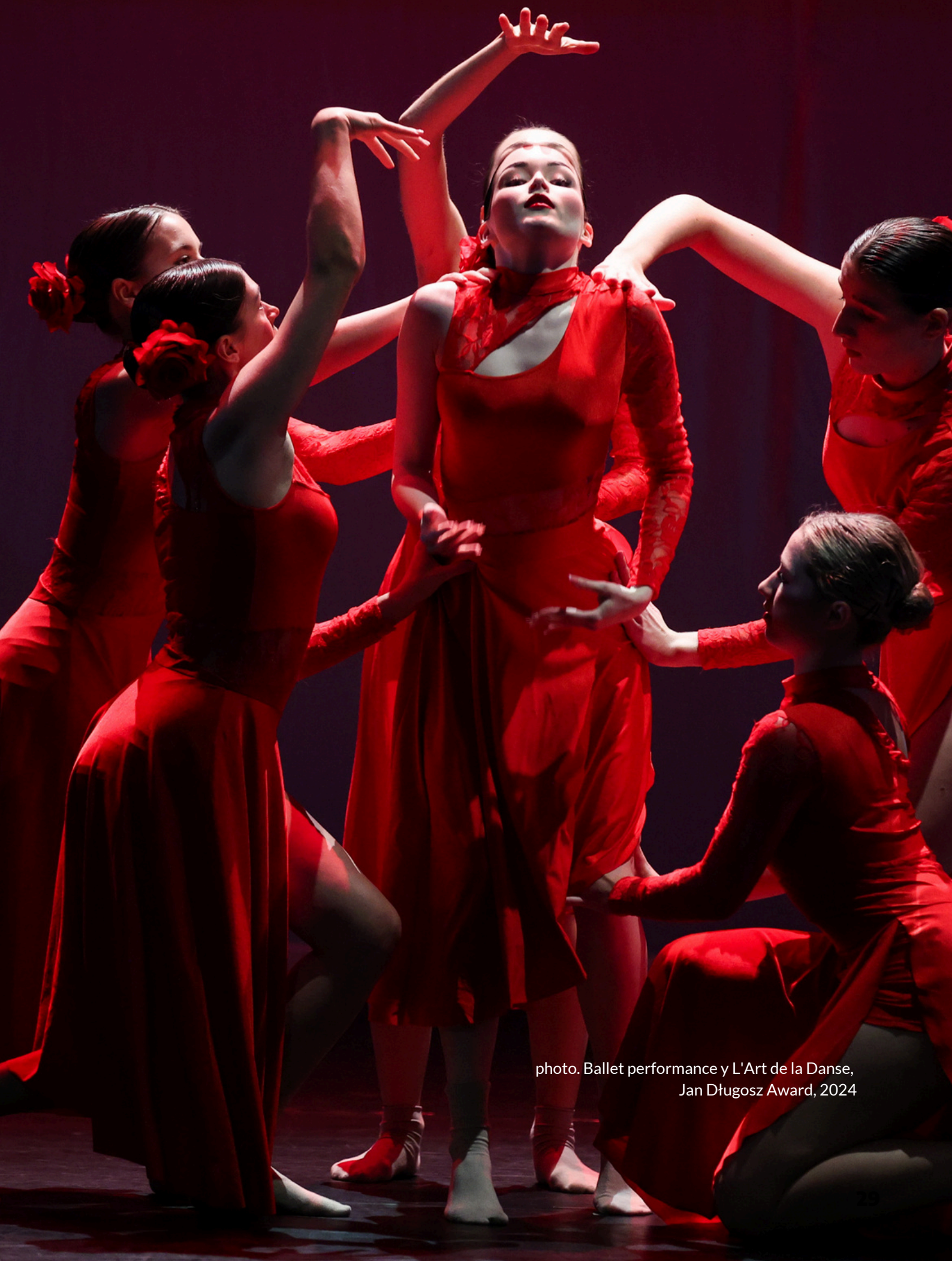
photo. Ballet performance y L'Art de la Danse, Jan Długosz Award, 2024