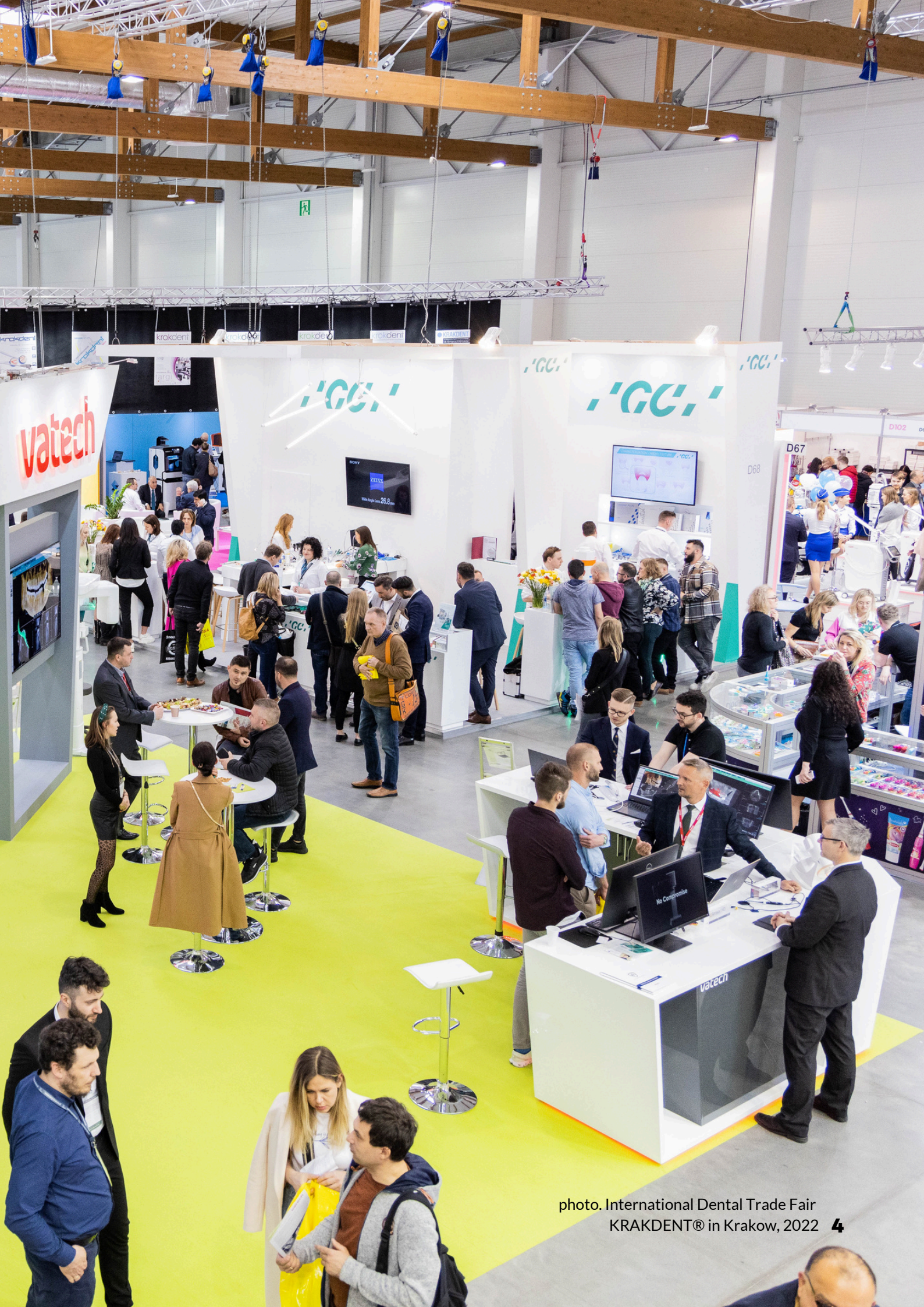
photo. International Dental Trade Fair KRAKIDENT® in Krakow, 2022 4