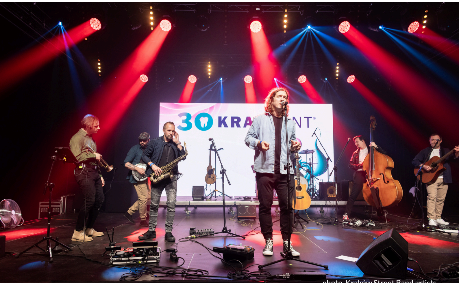
photo. Kraków Street Band artists, Banquet on the occasion of the 30th anniversary of the KRAKDENT® International Dental Trade Fair in Krakow, 2024

Events organised by Targi w Krakowie are often accompanied by formal galas and banquets, which are enriched by performances from artists, giving the ceremonies a unique ambiance. We carefully select collaborating performers, often inviting creators associated with the Krakow artistic community. An example of such activities is the participation of artists from the Nowy Proxima Theatre during the Jan Długosz Award Gala, organised as part of the 26th International Book Fair in Krakow®, and the concert by the Krakow Street Band, which enhanced the banquet for the 30th anniversary of the International Dental Fair KRAKDENT®. Thanks to such initiatives, events organised by Targi w Krakowie gain a unique artistic setting and remain in the participants' memories as exceptional experiences.