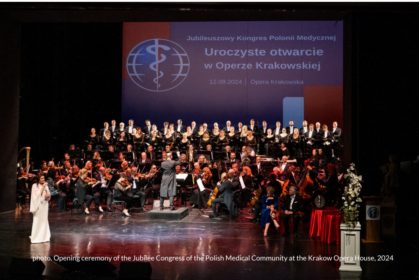
photo. Opening ceremony of the Jubilee Congress of the Polish Medical Community at the Krakow Opera House, 2024