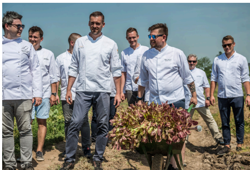
photo. Planting głąbik krakowski by the chefs, 2019