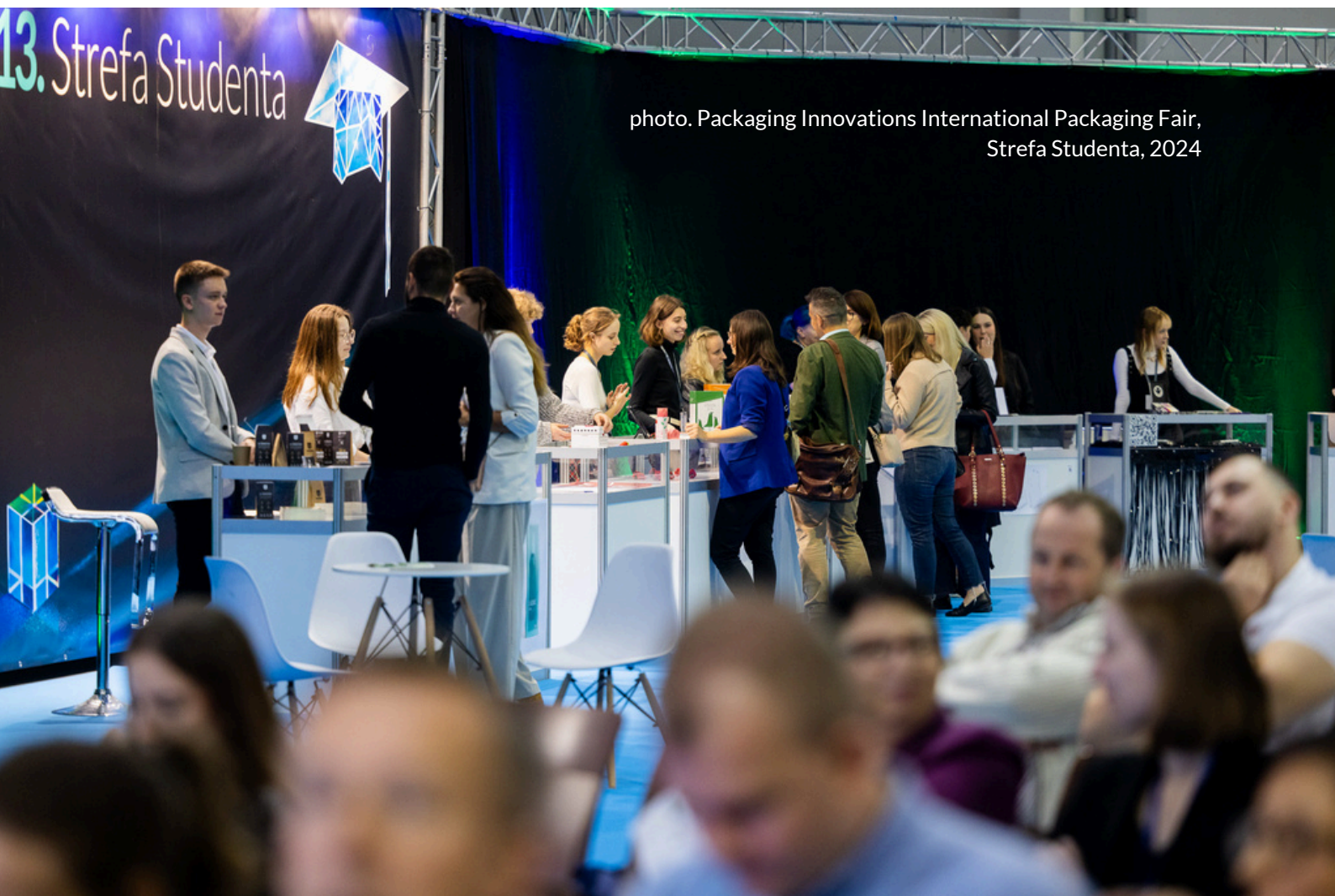
photo. Packaging Innovations International Packaging Fair, Strefa Studenta, 2024