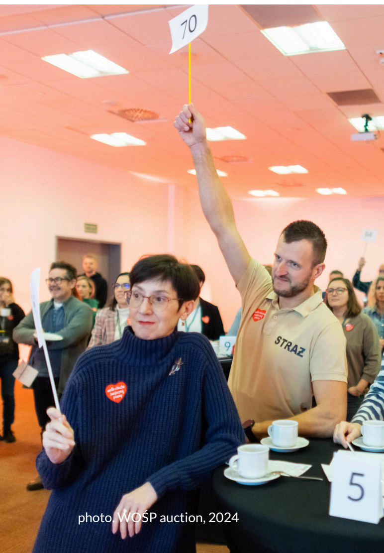
photo. WOŚP auction, 2024

Cheesecakes, mazurkas, challahs, tarts, preserves, sandwich spreads, porridges, as well as various services such as a professional photo session, a bouquet of flowers for a chosen occasion, a workshop on building a family tree, or a set of motivational books – these are just a few examples of items submitted for an internal auction organised by employees of Targi w Krakowie for the company's employees and partners. The goal was to support the Great Orchestra of Christmas Charity and the Krakow WOŚP Headquarters at the Krakow City Hall. Partners of Targi w Krakowie also joined the campaign, donating numerous items and participating in the auction themselves.