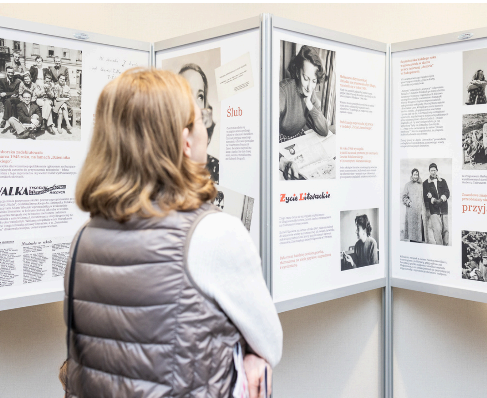
photo. Art exhibition „Sto lat! Wisława Szymborska” during 26. International Book Fair in Krakow®, 2023