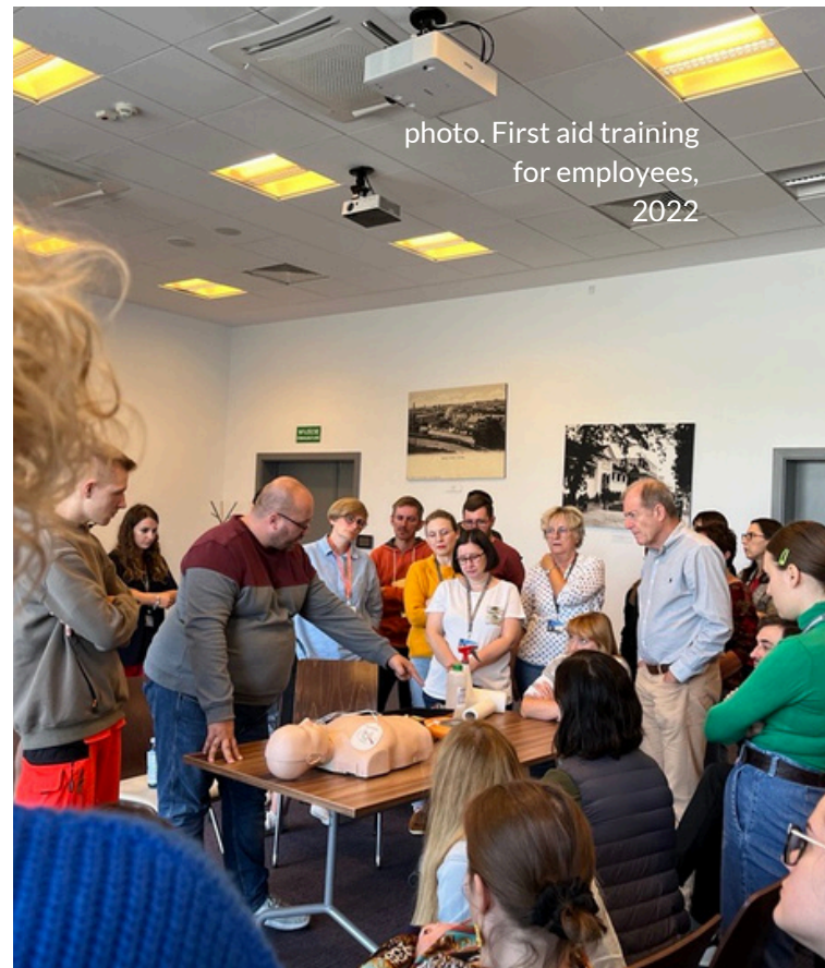
photo. First aid training for employees, 2022

We regularly participate in training courses and conferences on corporate social responsibility and sustainability, as well as creating spaces for knowledge ourselves. Trade fairs are no longer just exhibitions; they also feature an extensive accompanying programme. During our events, both exhibitors and visitors have the opportunity to participate in numerous training sessions, workshops, and presentations led by experts. Many of these meetings focus on sustainable development. Meetings of this type are held for the publishing, catering, wine, packaging, architecture and industrial sectors, among others. In addition, we regularly organise training courses to improve soft skills, as well as professional training for employees.