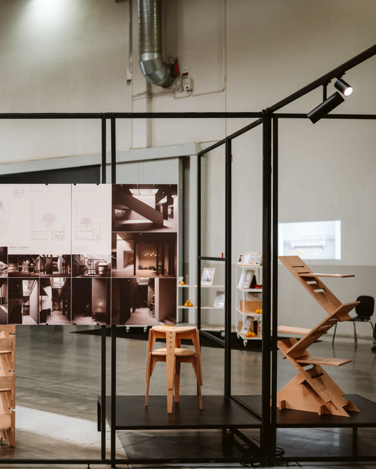
photo. International Architecture and Interior Design Fair, EXPO Krakow, 2024