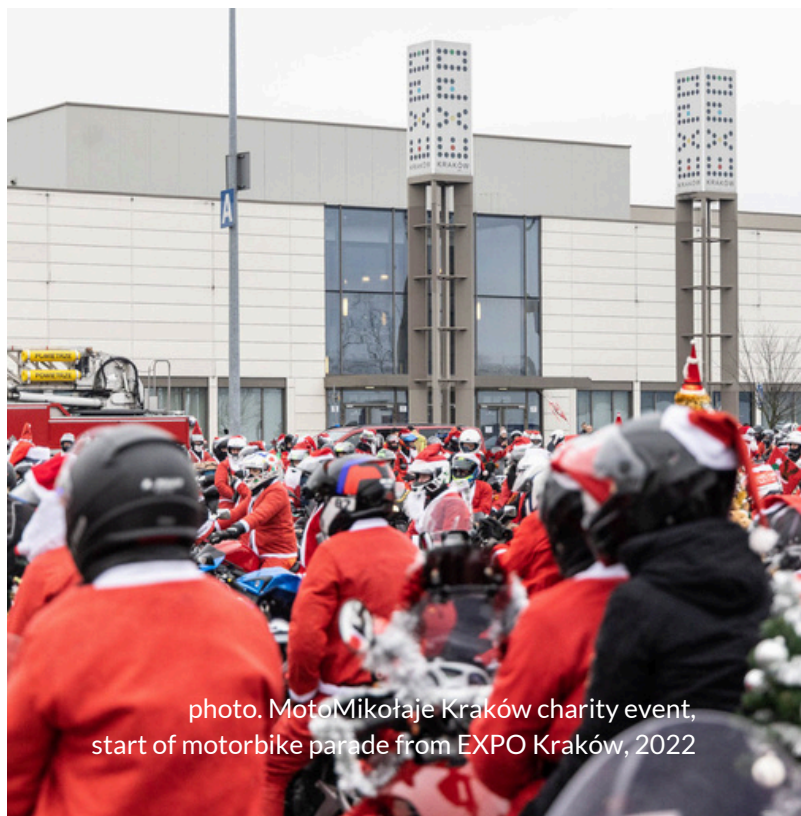
photo. MotoMikołaje Kraków charity event, start of motorbike parade from EXPO Kraków, 2022

Since 2022, EXPO Krakow has supported the MotoMikołaje from the "MotoMikołaje Krakow" Motorcycle Association, who in December set off with bags full of presents to the University Children's Hospital and the Babiński Clinical Hospital in Krakow. Their mission is to bring joy to hospital wards. EXPO Krakow is involved in the campaign on many levels – it provides the parking lot in front of EXPO Krakow as a collection point for hundreds of MotoMikołaje preparing for the spectacular parade, and actively supports the collection of presents for the young patients of the hospitals. They invite employees, business partners, exhibitors, and residents of Krakow to join the initiative, creating a space for collective action in support of children in hospitals.