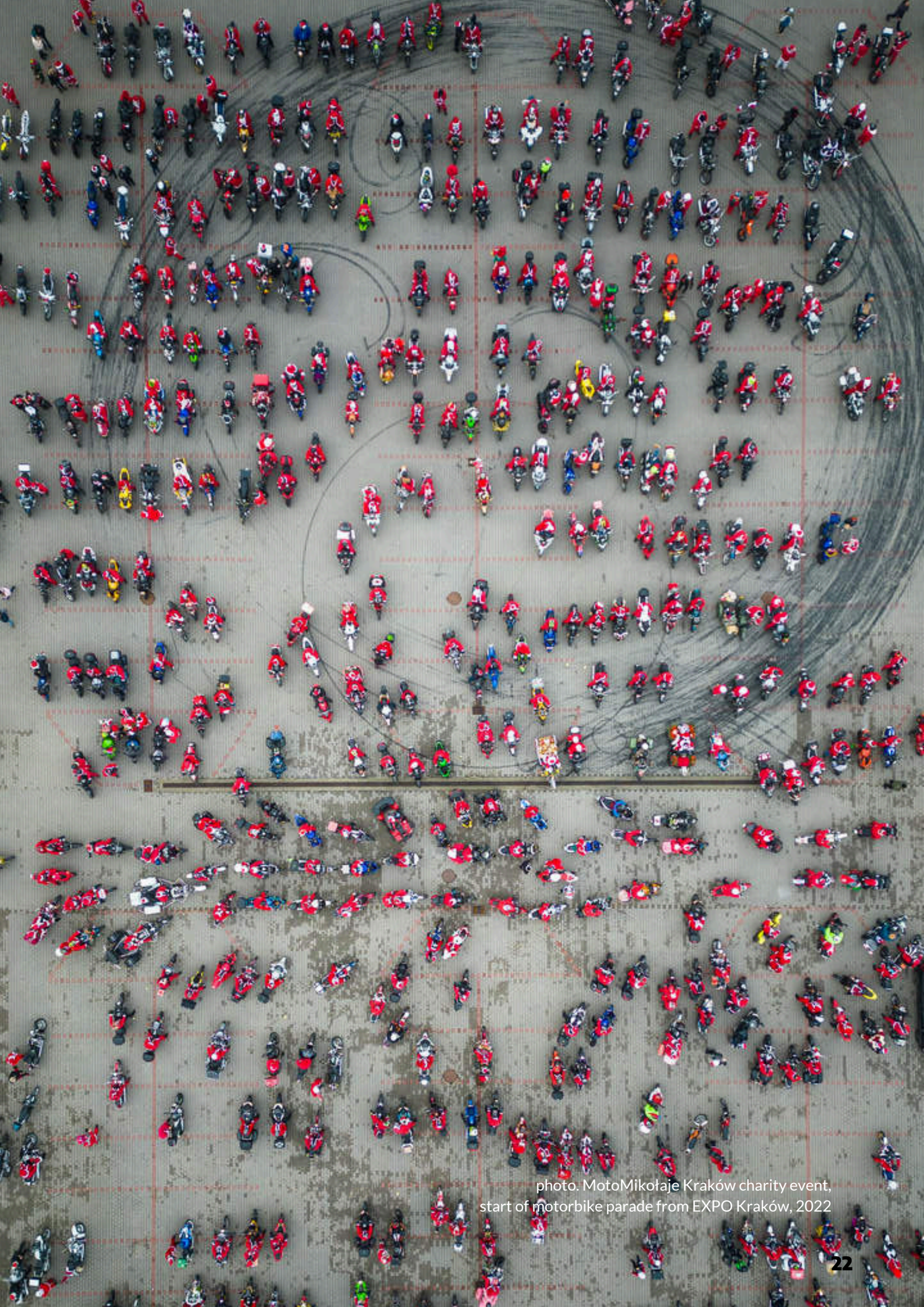
photo: MotoMikołaje Kraków charity event, start of motorbike parade from EXPO Kraków, 2022