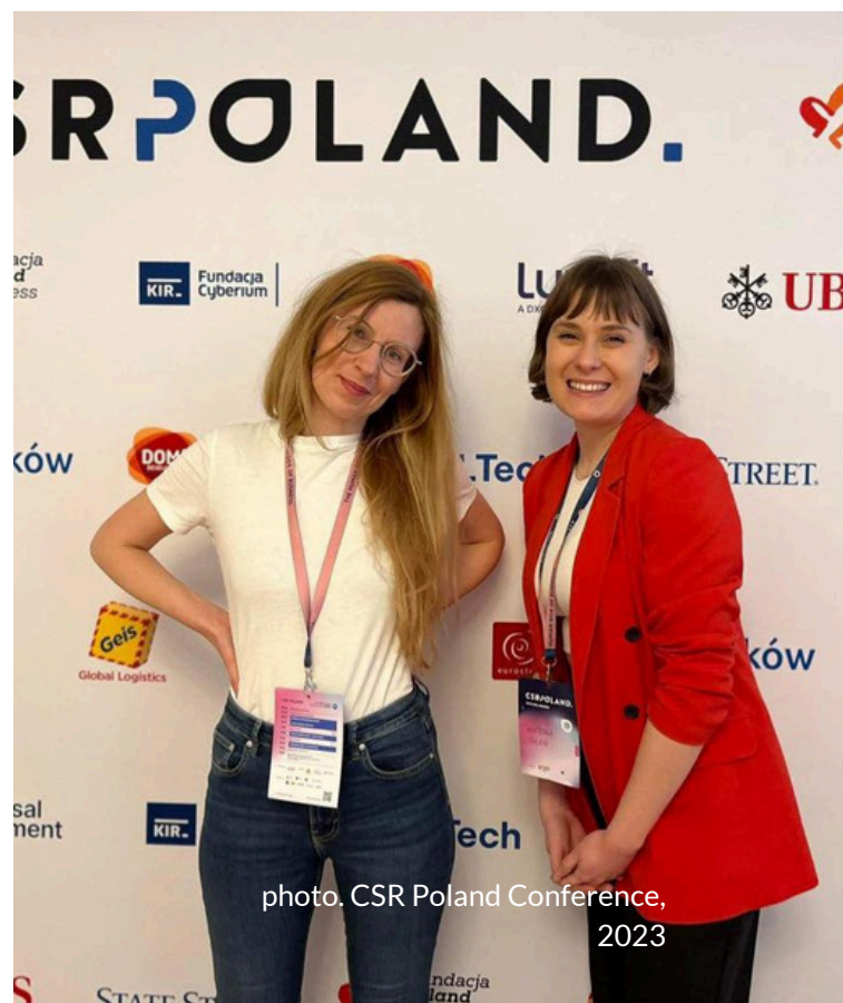
photo. CSR Poland Conference, 2023