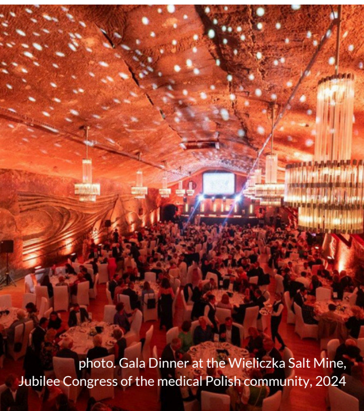
photo. Gala Dinner at the Wieliczka Salt Mine, Jubilee Congress of the medical Polish community, 2024