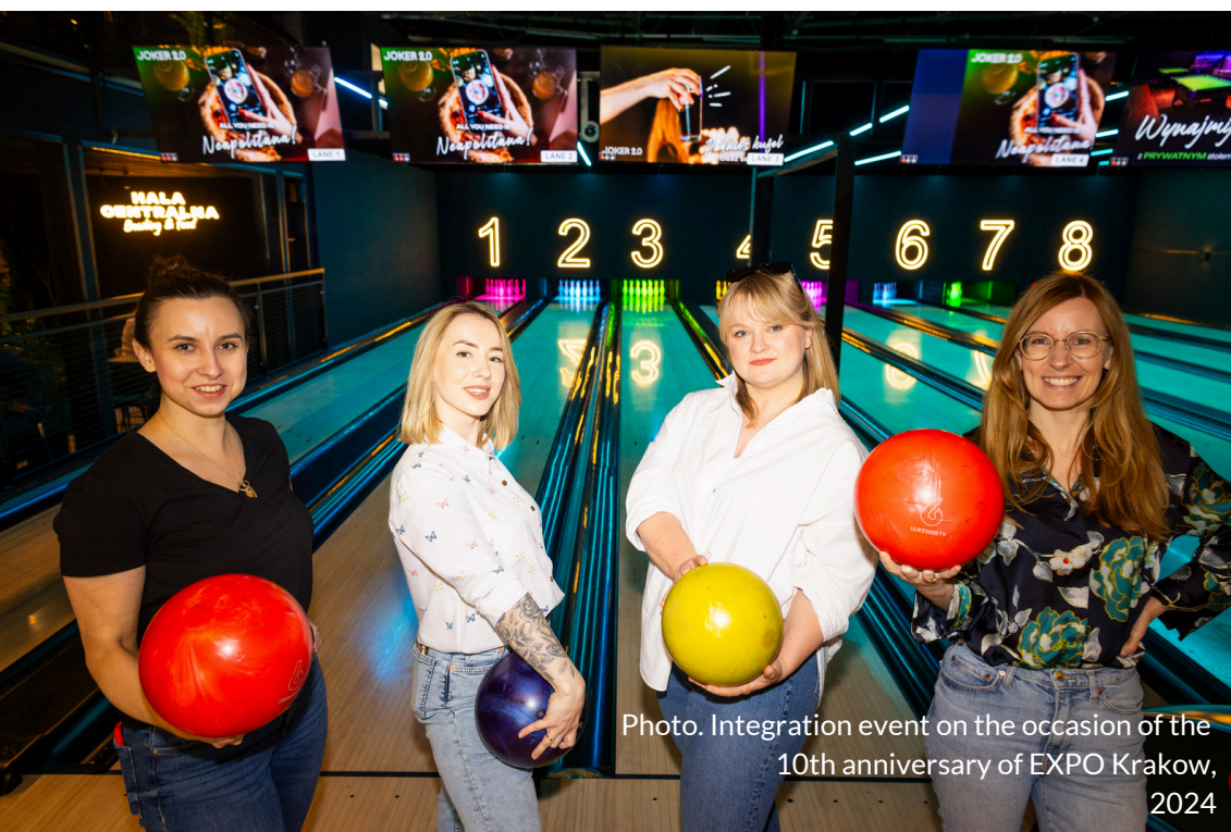
Photo. Integration event on the occasion of the 10th anniversary of EXPO Krakow, 2024

Our aim is to build credibility through transparent communication and consistent adherence to our principles and values.