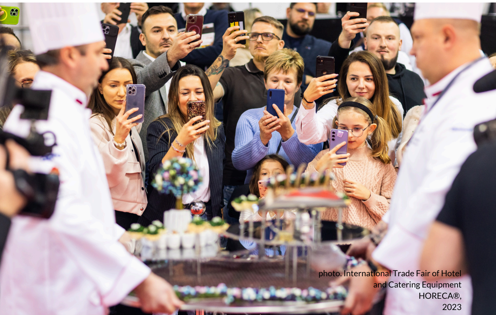
photo. International Trade Fair of Hotel and Catering Equipment HORECA®, 2023

In front of the entrance to the Dunaj Hall, there is a professionally equipped parent-child point. Additional facilities for the youngest visitors to EXPO Krakow include toilets adapted to the height of children.