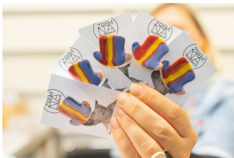
photo. Pins for cylinder of Juliusz Słowacki, International Book Fair in Krakow®, Żrem na Talerzach, 2022