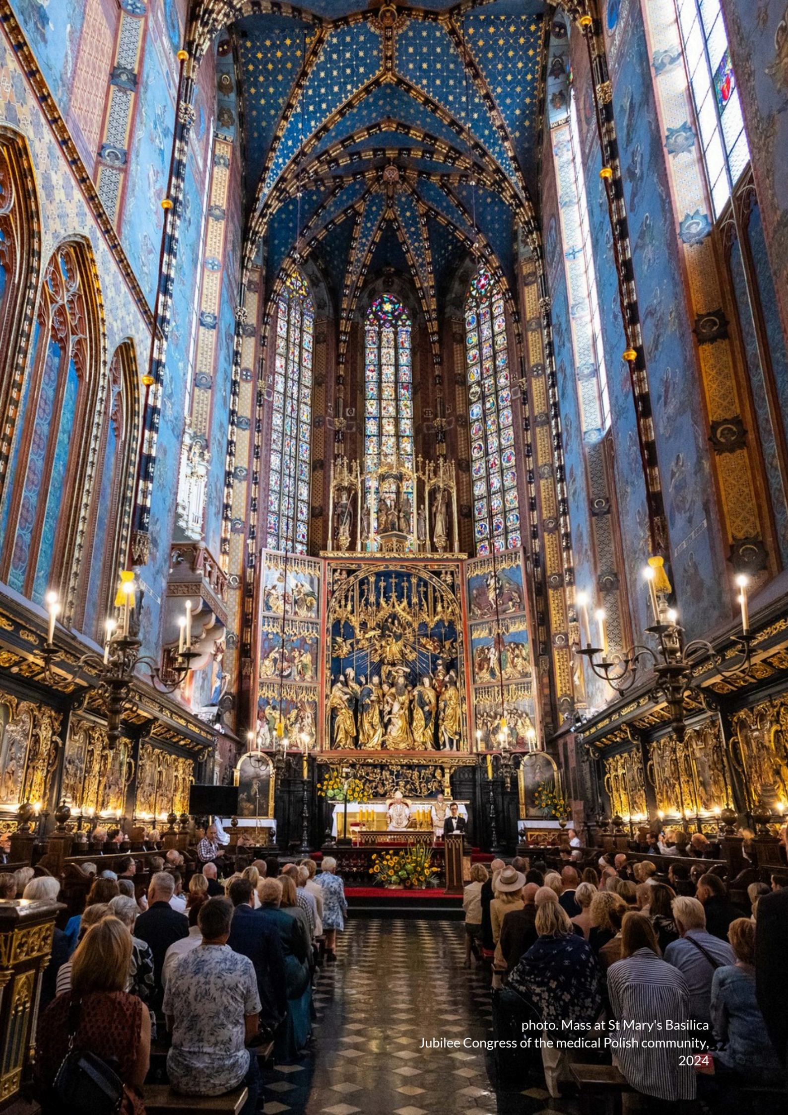
photo. Mass at St Mary's Basilica Jubilee Congress of the medical Polish community, 2024