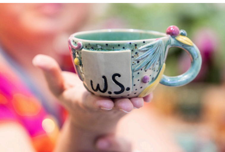
photo. Teacup Wisława Szymborska, International Book Fair in Krakow®, Żrem na Talarzech, 2023

We are keen to support and promote local craftsmen. An example of this is the collaboration with the company Żrem na Talerzach – a ceramics and jewellery workshop, whose products are characterised by a unique style and high quality. We order unique gifts for our clients from them, allowing us not only to provide exceptional presents but also to support the development of local craftsmanship and promote handmade products. Such partnerships help build lasting relationships with artists and contribute to the revitalisation of the local economy, while also giving our clients the opportunity to experience the authentic beauty of handcrafted culture.