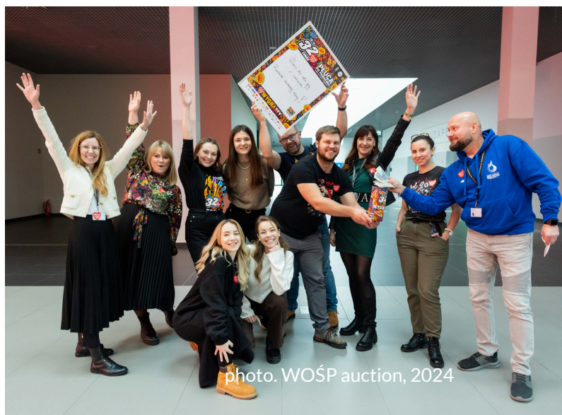
photo. WOŚP auction, 2024

Meetings with volunteers from the Krakow WOŚP Headquarters during events organised by the company have become a tradition. One example is the International Book Fair in Krakow®, where publishers are keen to donate books for auction.